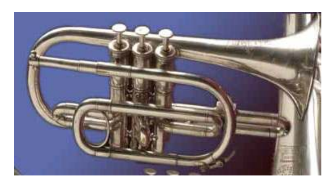
Boosey cornet marked Pond & Co., c.1879

Boosey & Co. brass instruments found marked with "Wm. A. Pond & Co. Sole US Agents" date to between 1874 and 1886 which fits with Pond's death in 1885. After this, Boosey instruments are sold through Root & Sons in Chicago.